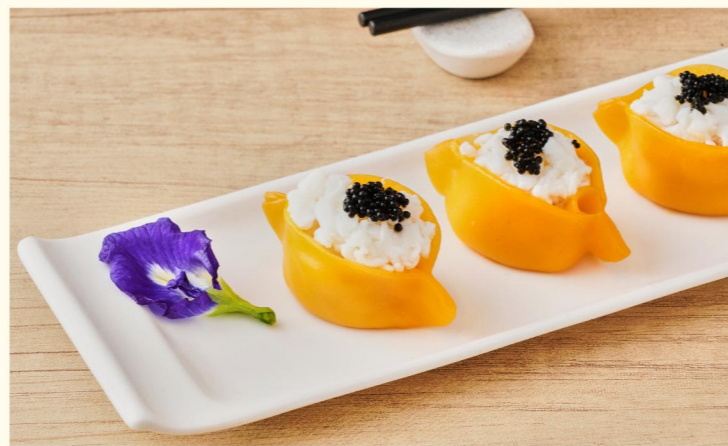
A7 赛螃蟹蒸凤眼饺 $6.80 Steamed Shrimp Dumpling · Egg White