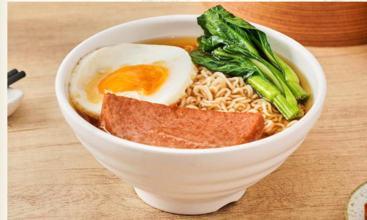
H3 港式餐蛋汤面 Luncheon meat and Egg Noodle Soup $7.80