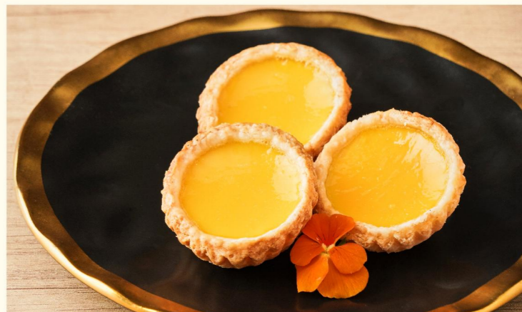
B10 酥皮蛋挞 Mini Egg Tarts