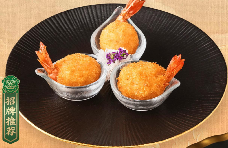
B1 黄金凤尾虾 Deep-fried Phoenix-tailed Prawn · Bread Crumbs