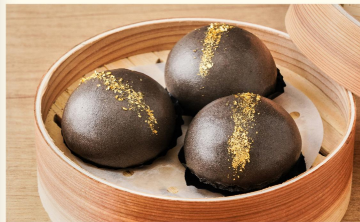
A10 竹炭黑金流沙包 $6.80 Steamed Charcoal Salted Egg Yolk Buns