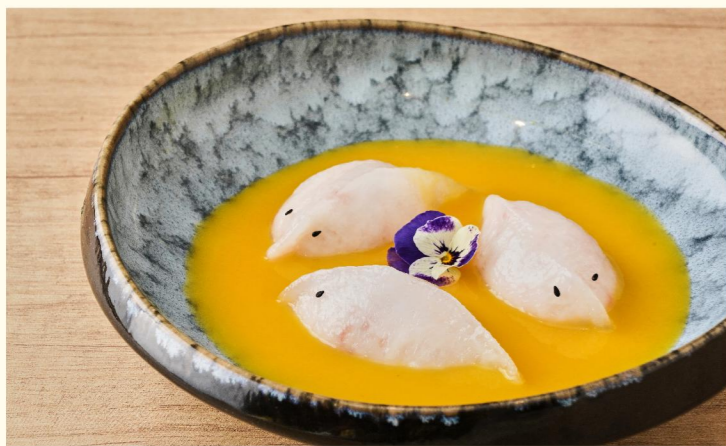
A6 金汤鳕鱼饺 $6.80 Steamed Cod Fish Dumpling · Pumpkin Sauce