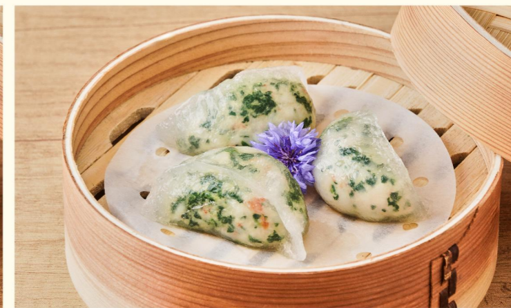
A11 菠菜带子饺 $5.80 Steamed Scallop Dumpling · Spinach