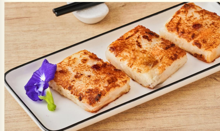
B9 腊味萝卜糕 Pan-fried Radish Cake