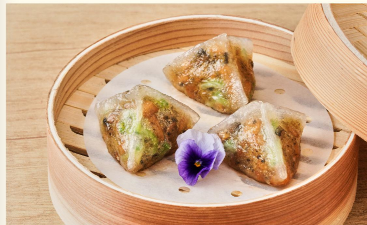
A8 松露素菌饺 $5.80 Steamed Mushroom Dumpling · Vegetable · Truffle