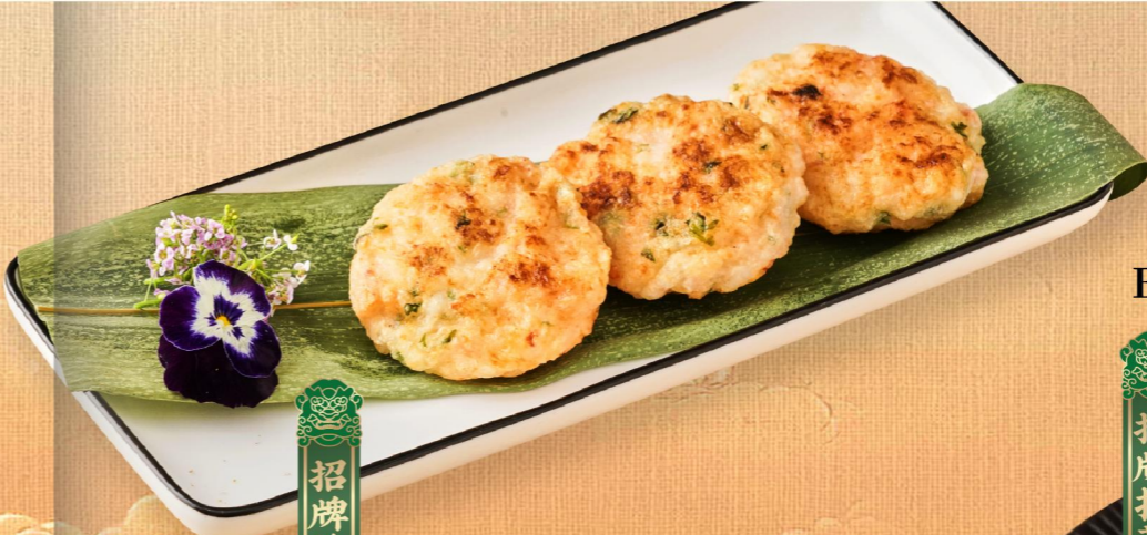
B3 香煎墨鱼饼 Deep-fried Squid