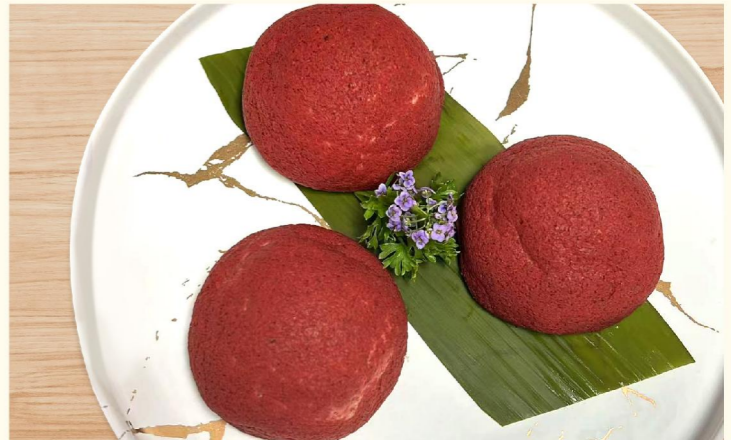
B12 脆皮雪山包 Baked BBQ Pork Bun