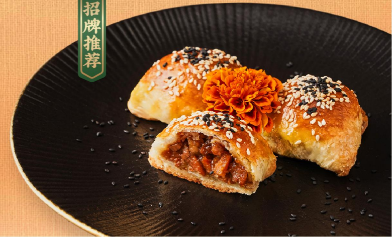
B4 蜜汁叉烧酥 Baked Honey Pork Puff