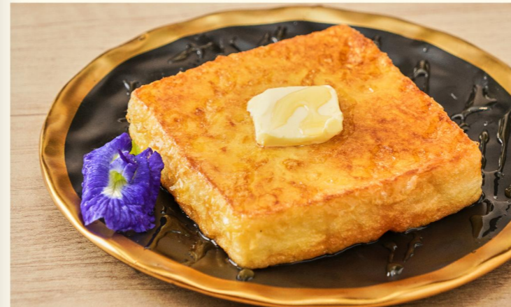
B11 西多士 French Toast