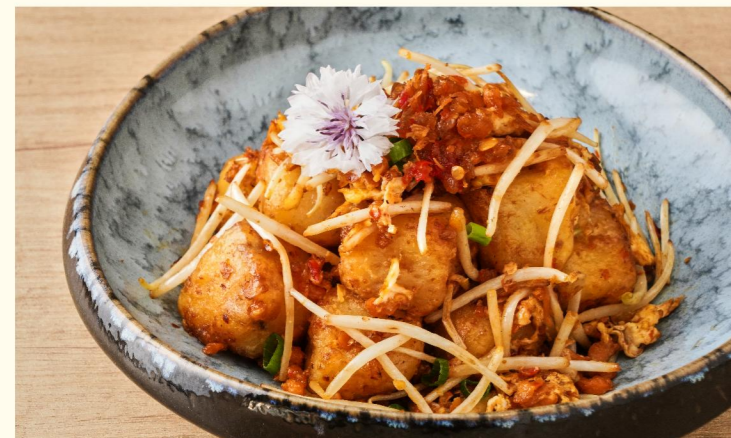
B5 XO酱炒萝卜糕 Fried Carrot Cake · XO Sauce