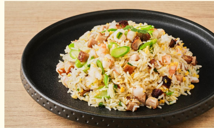
G3 扬州炒饭 Yang Zhou Fried Rice $12.80