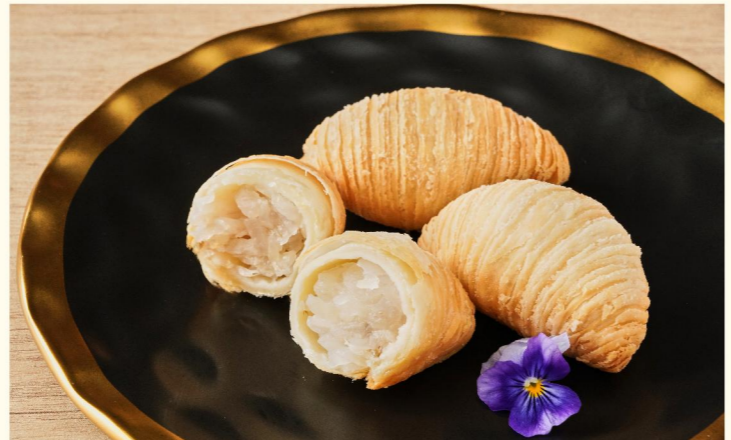
B8 萝卜丝酥饼 Deep-fried Puff · White Turnip