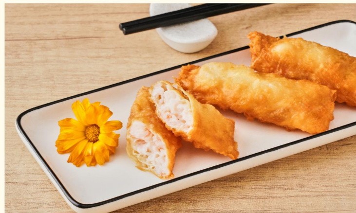
B6 鲜虾腐皮卷 Deep-fried Beancurd Roulette, Shrimps