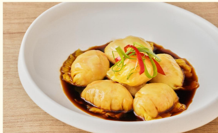
A5 红油抄手 $8.00 Meat Dumpling in Chilli Oil