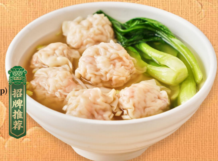
H1 凤城水饺面(干/汤) Shrimp Dumpling Noodle (Dry/Soup) $7.80