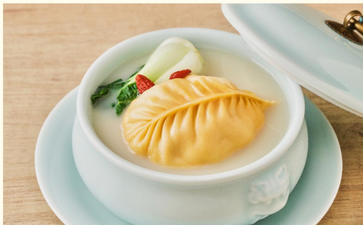
A4 经典灌汤饺 $12.80 Steamed Seafood Soup Dumpling