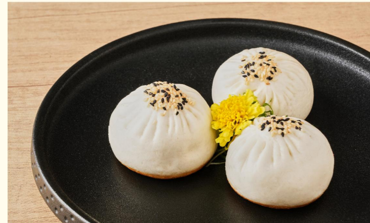
B7 上海生煎包 Pan Fried Shanghainese Pork Bun