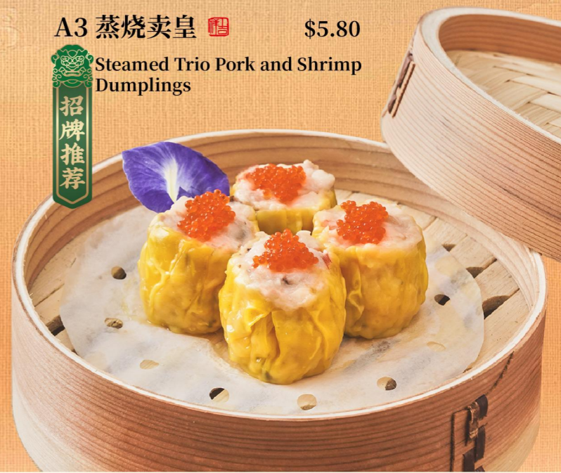
A3 蒸烧卖皇 $5.80 Steamed Trio Pork and Shrimp Dumplings