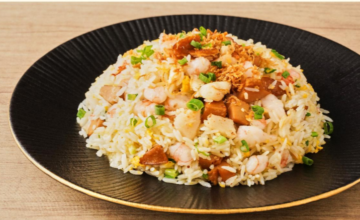
G6 海皇炒饭 Diced Abalone · Sea Cucumber · Scallop Fried Rice $18.80