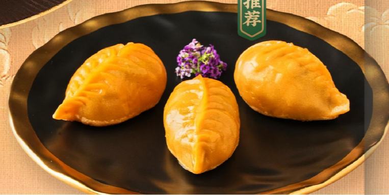
B2 招牌香煎饺 Signature Pan-fried Pork Dumpling · Chives