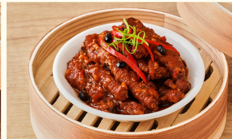
A9 秘酱蒸凤爪 $5.80 Steamed Chicken Claw